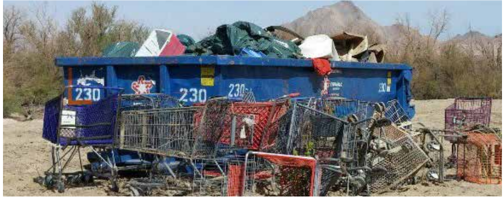
More than 200 participants removed over 3,500 pounds of trash from Wetlands Park during the October 8th Wetlands: Hands On! event.

drinking and violence that has occurred in the park. At 2,900 acres, Clark County Wetlands Park, combined with its rustic nature, creates challenges for law enforcement. Because issues tend to occur on holidays, evenings and weekends when school is out of session, efforts have included getting the word out to youth in the community that illegal activity won't be tolerated.